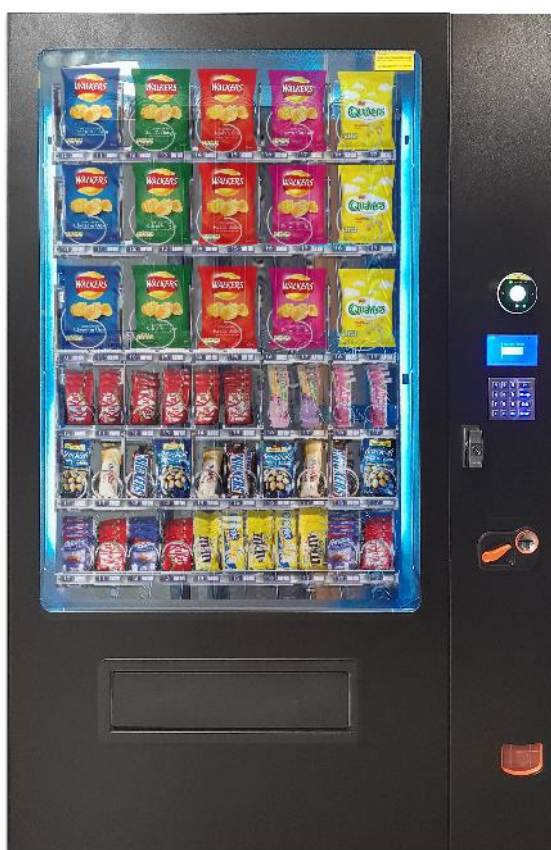
Refresh 60 with cash and optional cashless mechanism, and Nayax dot reader.